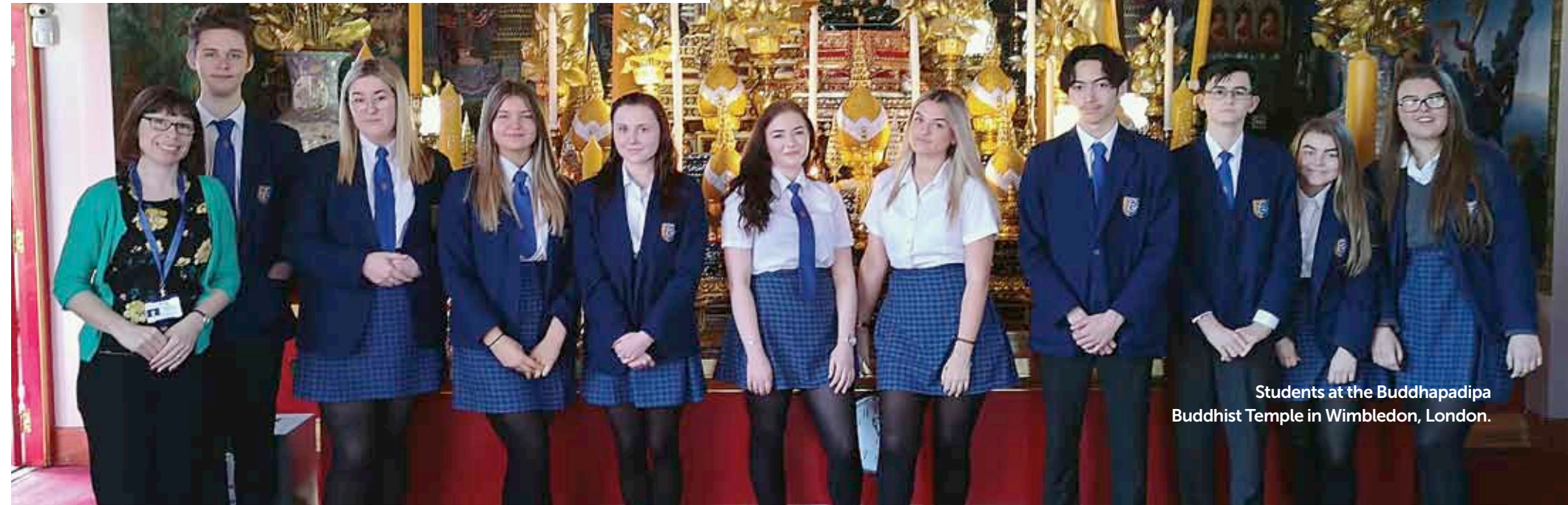
Students at the Buddhapadipa Buddhist Temple in Wimbledon, London.

At Aylesford we are open-minded and compassionate. Our students are encouraged to explore different cultures and views.