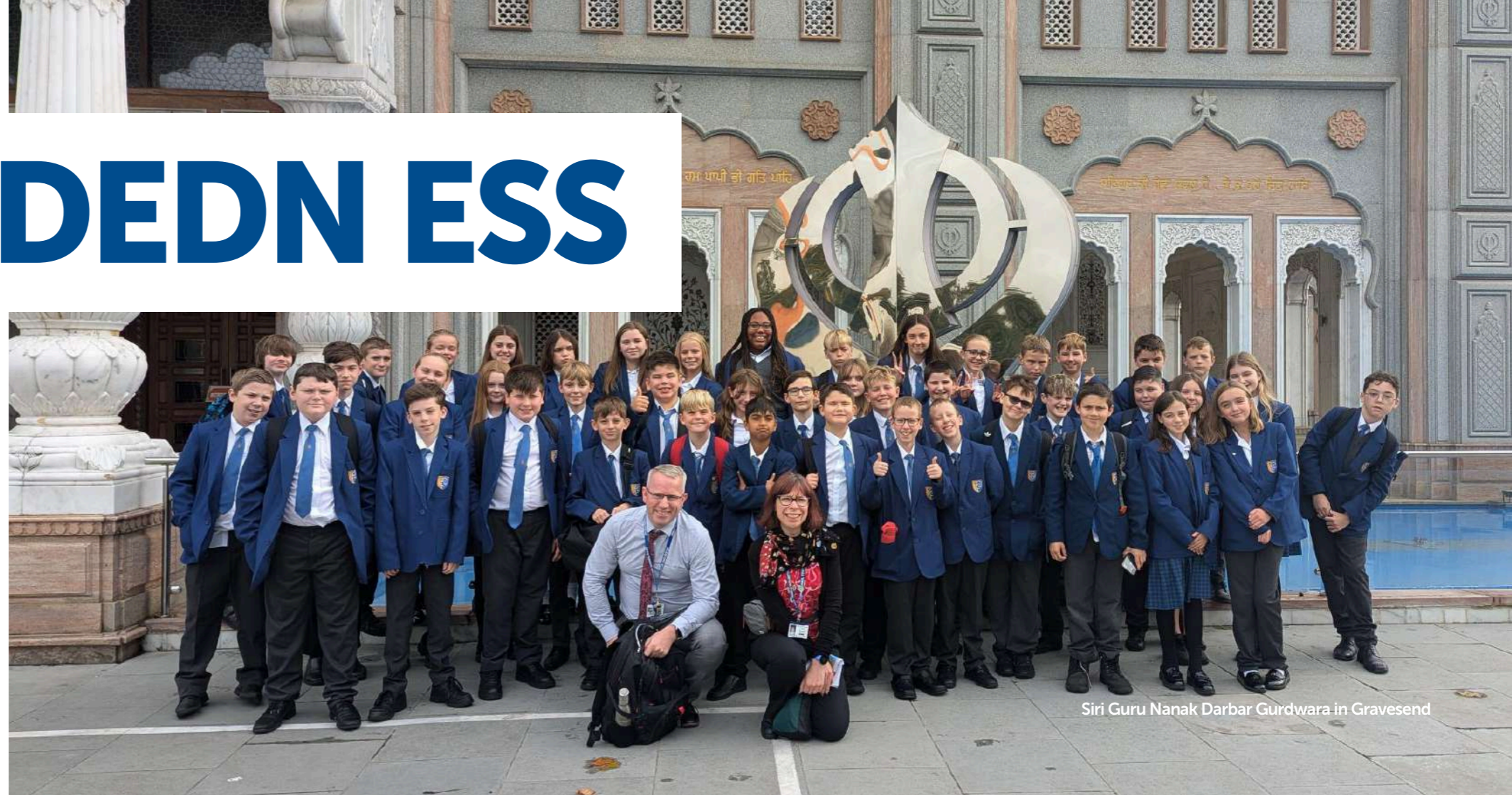
Siri Guru Nanak Darbar Gurdwara in Gravesend

At Aylesford we are open-minded and compassionate. Our students are encouraged to explore different cultures and views.