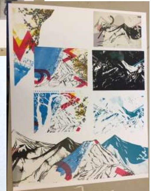
(Right) Example of student's work who received help with portfolio presentation